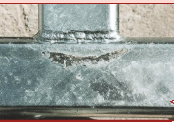
Burned oil during welding