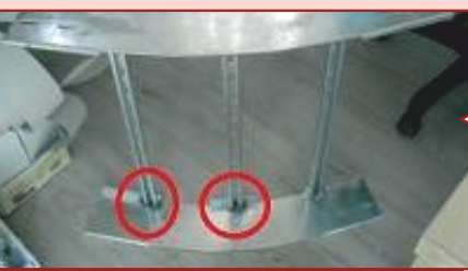
Uncoated areas in welding zone